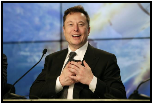
ELON MUSK speaks during a news conference after a Falcon 9 Space X rocket test flight in 2020.