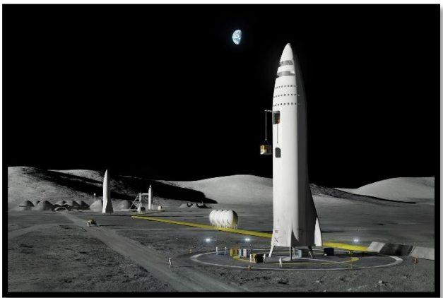
ARTISTIC RENDERING made available by Elon Musk in 2017 shows SpaceX new mega-rocket design on the earth’s moon.