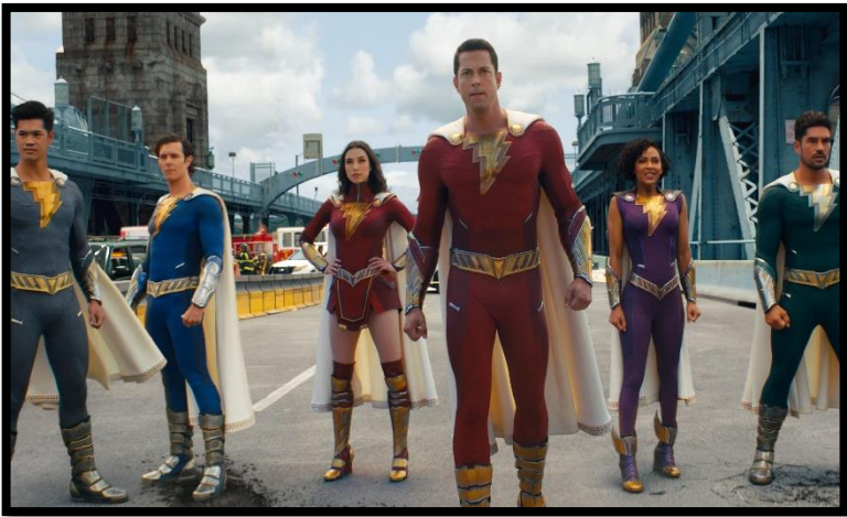
The cast of Shazam.

Need a recommendation for a good movie? Consider seeing the new release Shazam–The Fury of Gods . This movie has new and interesting differences from the first Shazam because the first film begins with a child becoming an ancient wizard and in the new film he is already a wizard. In the new Shazam , there are six wizards instead of one or two and, like in the first film, they're still keeping the secret from their foster parents. In the new film, Billy and his family are fighting a Greek goddess and a series of powerful people to save the city. The actors are Zachary Levi, Asher Angel, Grace Fulton, Mark Strong, Jack Dylan Grazer, Djimon Hounsou, Micheal Borth and Adom Brody. Shazam is a movie created with lots of imagination and a sense of humor. Currently in theaters, Shazam will be coming to HBO Max on March 17th, 2023.