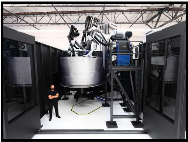
Relativity Space shows off the world’s largest 3D metal printer which they are using to print rockets